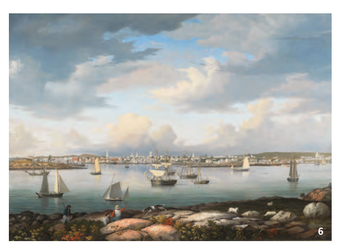
FITZ HENRY LANE Fitz Henry Lane (1804–1865) was an artist, printmaker and world-renowned American marine painter. The Cape Ann Museum's unparalleled collection of Lane's work includes 40 paintings, a rare watercolor (his first known work, painted in 1830) and 100 drawings, plus lithographic town views. In 2016 the Museum launched Fitz Henry Lane Online , an online catalogue raisonné and research tool, featuring new information about Lane's works and rich historical and archival material related to his pictures and the subjects he depicted. Find out more at fitzhenrylaneonline.org .