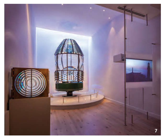
FISHERIES & MARITIME The Fisheries and Maritime collection reflects Cape Ann's prominence in fishing, maritime trade and shipbuilding over a period of 300 years. Objects on display in two dedicated galleries include three intact historic vessels; detailed 19th century ship models; tools and artifacts of the industry; historic photos; and sculpture and fine art inspired by the fishing industry, which help to place these artifacts in context. In addition, the Museum is now home to an original first order Fresnel lens, housed in its own gallery.