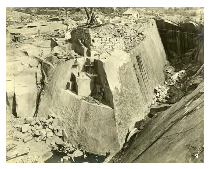
GRANITE QUARRYING Perched on a granite ledge, Cape Ann is littered with large granite boulders that define the coastline and pop up throughout the interior. The Museum's Granite Quarrying Collection contains samples of local granite, tools, equipment, personal effects, documents, photographs, paintings and sculpture, all of which help to illustrate the unique history of this industry on Cape Ann.