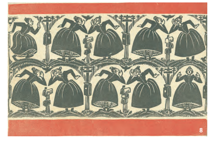
FOLLY COVE DESIGNERS The Cape Ann Museum houses the largest collection of the work of the Folly Cove Designers, a guild of textile designer-craftsmen who worked together from 1941 until 1969. The collection, housed in a single dedicated gallery, includes printed textiles and paper, items made from their fabrics, examples of linoleum blocks they carved, the Acorn Press they used to make prints, ephemera and historic photographs.