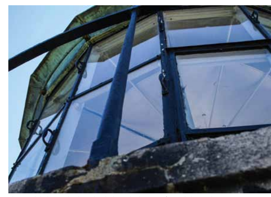
The South light on Thacher Island where the lens was formerly housed.

The fundraising and acquisition are only the first phase of the Fresnel Lens Project. Phase II involves creating a permanent gallery and exhibition space and is tentatively scheduled to be completed by late spring of 2014.